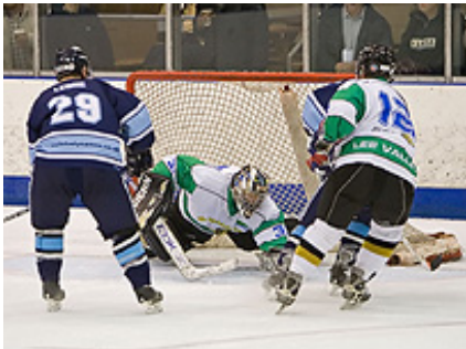
Lee Valley Lions in Action

You are in: London > Sport > Other Sports > Lee Valley Lions