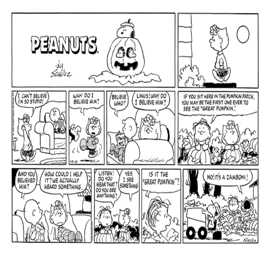
The last Zamboni machine strip drawn by Charles Schulz was published October 31, 1999